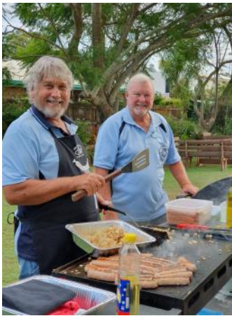
The March Cooks