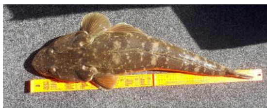
Ron's winning fish in the boat comp, returned to the water unharmed after weighing and measuring.