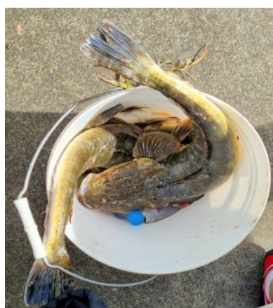
A bucket full of fish