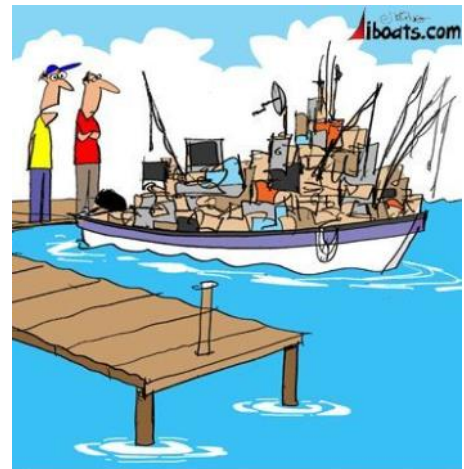
"That settles it. We either get a bigger boat, or cut back on the fishing equipment."