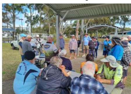
Everyone gathers around to hear the results