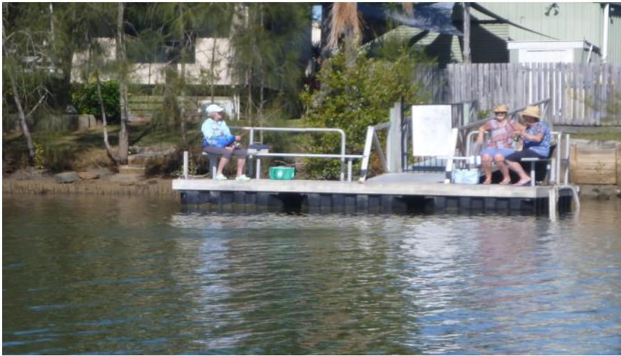
Some of the ladies chose to fish from the jetty

Wind drops, tide turns, burley drifts onto my line placement on the edge of a bank, and the secret bait,