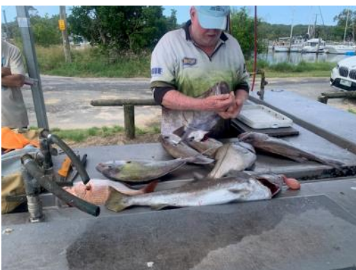
Cleaning the fish

We stayed again at the Bowlo and headed home early next morning.