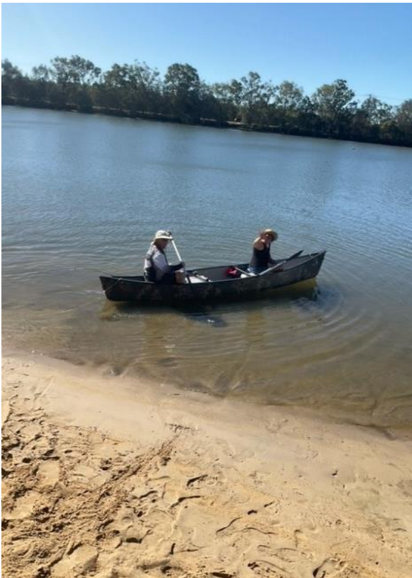
A couple of members thought they'd have a go at fishing from their canoe