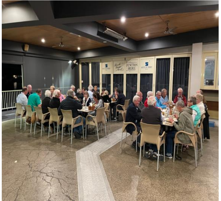
Dinner and presentations at the nearby pub.