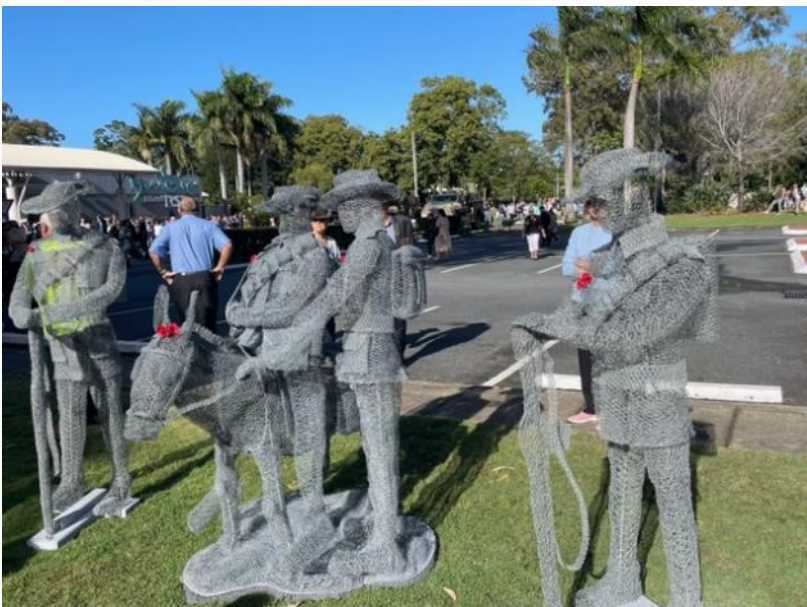
Wire statues outside the RSL Club