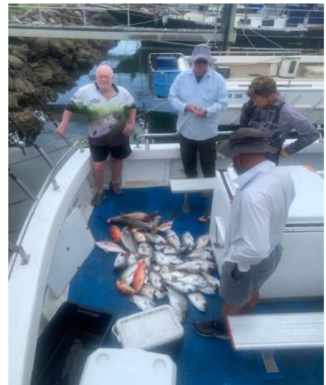
"Where do we start?"

So on to Evan's Head we go in his new BMW, to try our luck. A night's stay at the cabins at the Bowling Club, and as he won a brekky tray at the Bowlo, we had a hearty breakfast and onto the boat ("Pirate") at 5.30am. There were four others on the boat as well, but I was the only fisherman of 4 previous trips. Two hours out and we were onto some reasonable snapper by NSW sizes. I could see by the smile on my friend's face that maybe this was all he needed to get his mojo back. We caught 35 fish that day, mostly by my mate and myself, so after cleaning, filleting, and packing and splitting 6 ways, we all went and had a coldie at the local hotel and parted our ways.