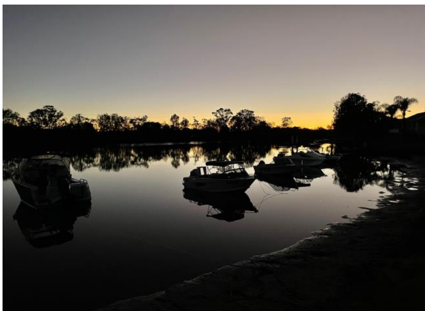
Dawn over the boats on competition day.

A few anglers went down to the main bridge and beyond, but most stayed around the Bli Bli bridge area.