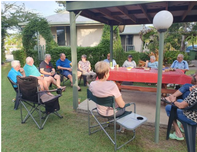
Happy Hour on Sunday afternoon