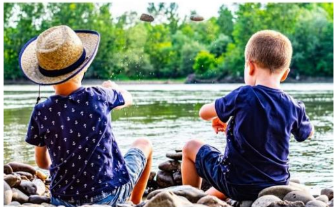
5 YEAR OLD WITH ROCKS