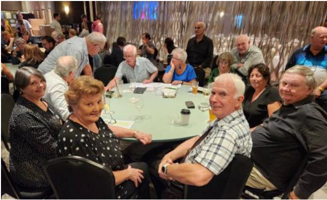
Some of our members at the Calcutta Night