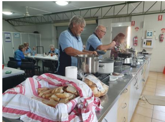
August soup day

There were seven very yummy soups on offer, and many people went back for more tastings.